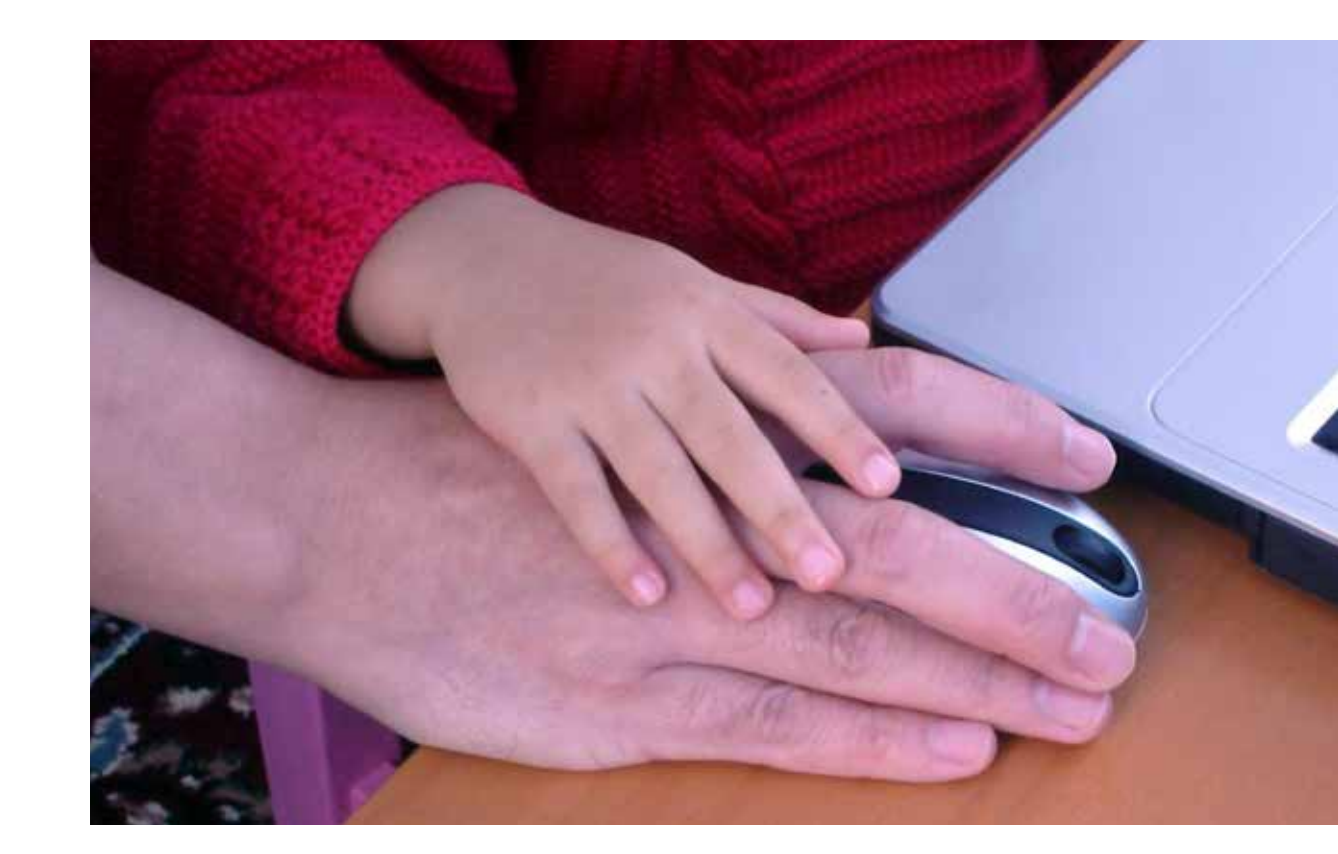
Table 4 provides guidance for content providers, online retailers and applications developers on policies and actions they can take to enhance child online protection and participation.

The Internet provides all types of content and activities, many of which are intended for children. Content providers, online retailers and app developers have tremendous opportunities to build safety and privacy into their offerings for children and young people.