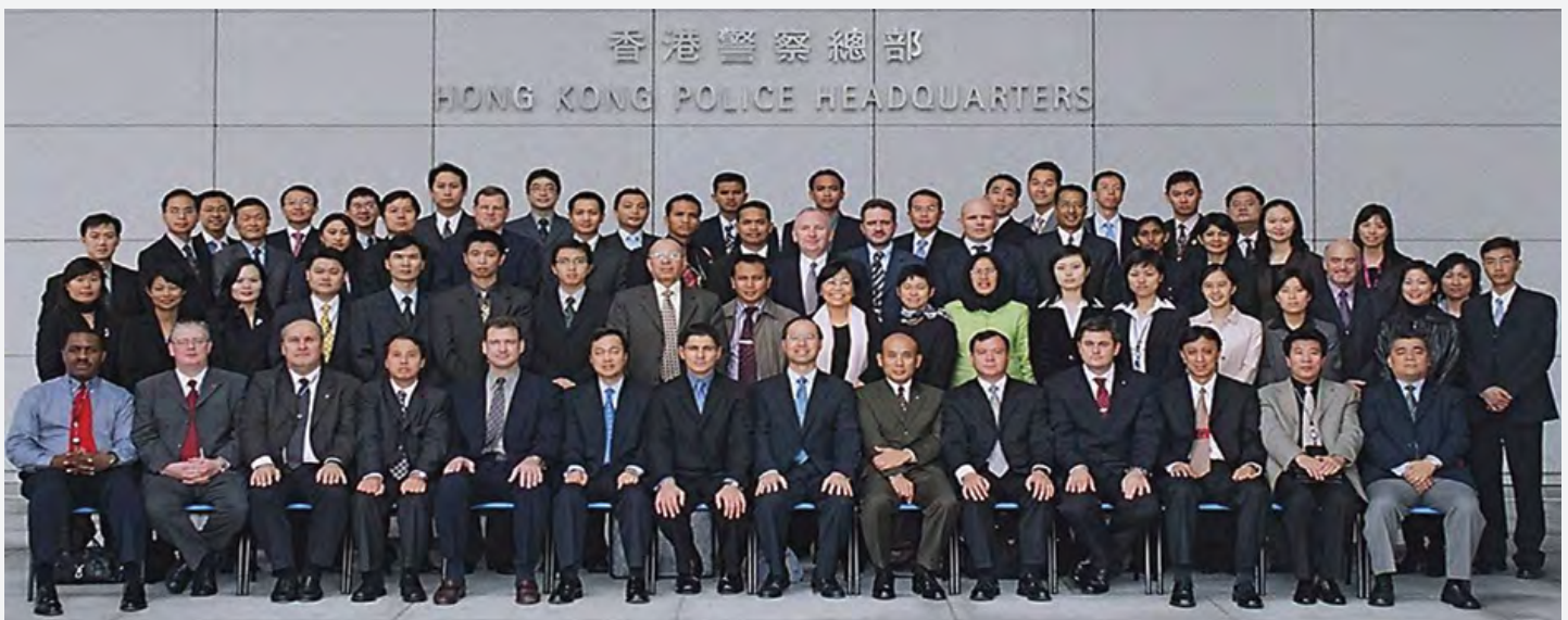
Law Enforcement Training, Hong Kong Police Force

ICMEC has trained more than 7,000 law enforcement officers, investigators, prosecutors, and other specialists from more than 115 countries.