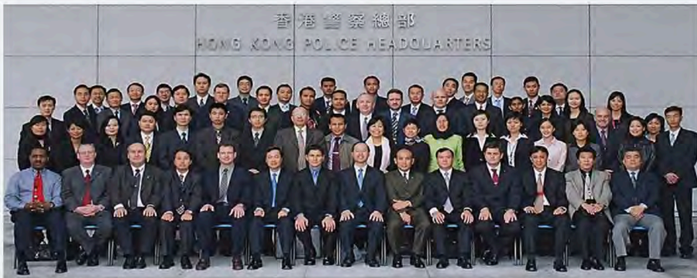
Law Enforcement Training, Hong Kong Police Force

ICMEC has trained more than 7,000 law enforcement officers, investigators, prosecutors, and other specialists from more than 115 countries.